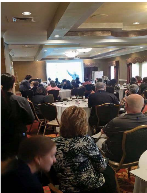
Keynote Speaker captivating members at the 2015 Fall Workshop

In addition to annual events, FAPPO hosts NIGP 3-day core classes at subsidized rates. The host facilitator receives a complimentary registration for attending the class.